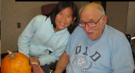
Pumpkin Painting with Seniors