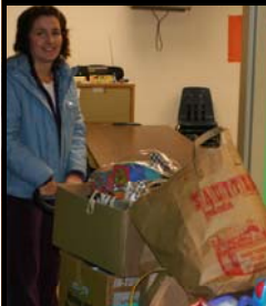
Clothing/Toy Drive for Foster Children