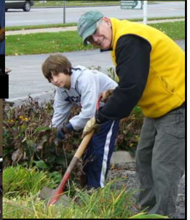
Landscaping at The Ability Center