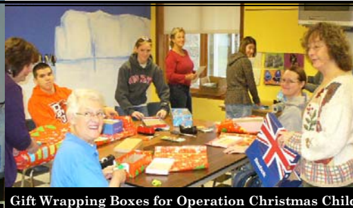
Gift Wrapping Boxes for Operation Christmas Child