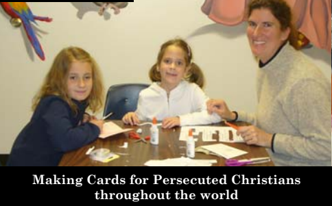
Making Cards for Persecuted Christians throughout the world