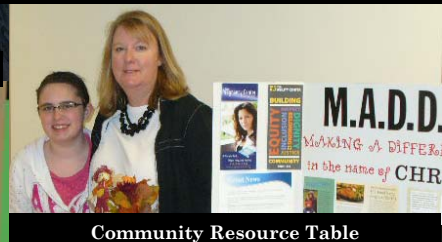
Community Resource Table