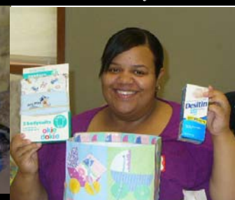
Pregnancy Center Baby Shower