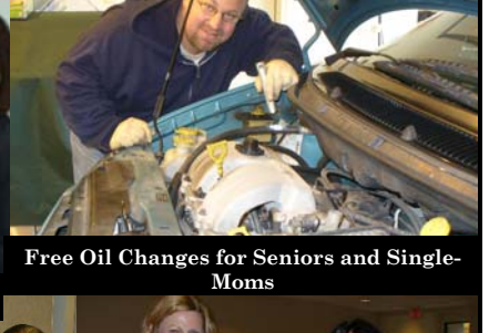
Free Oil Changes for Seniors and Single-Moms