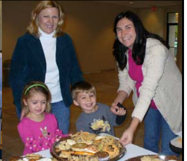
Cookie Trays and Prayer for Fire-fighters and Policemen