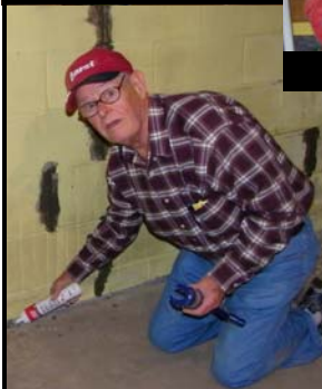
Habitat for Humanity Project