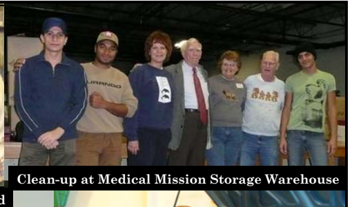
Clean-up at Medical Mission Storage Warehouse