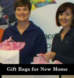
Gift Bags for New Moms