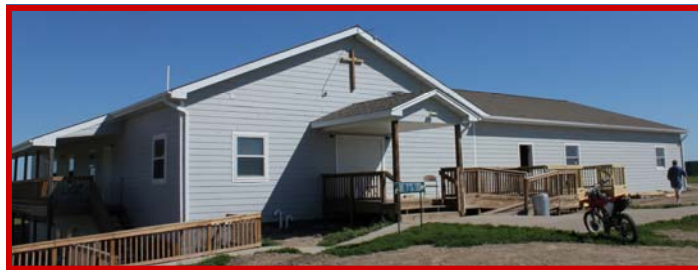
After Building Addition is “In the Dry”