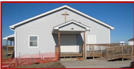
Original Ikce Oyate Christian Center

We are so very thankful for the many folks that have donated time, talents, finances, and expertise to this project, which will allow it to be completed and useful to the community. Folks working on this project have been from various states which include: FL, GA, IA, IL, IN, KS, MD, MO, NC, NM, NY, OK, PA, TX, SD. For more information, please see “Construction Update” under “News” on the main menu of our website, www.d-w-m.org .