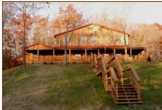
Bear Creek Lodge

With a 10,216 sq ft lodge, bedrooms with bunk beds, queen beds & bunk beds, queen beds for couples, separate bath areas for men and women, a large dining area that will accommodate any size hunting party or group who wish to use the lodge for a retreat, a commercial grade kitchen to accommodate small hunting parties or large retreat groups, cozy fireplaces to sit around after a long day's hunt or horseback ride and hike, gathering areas with large flat screen TV's and direct TV for all sports, news and general programming, DVD players for viewing of the day's hunting videos, etc..., gaming tables for card playing, ping pong and billiards table, along with a hot tub on the front wrap around porch overlooking the lake for a relaxing evening after a long day's hunt, and an open gas fire pit to warm up by out on the porch . . .