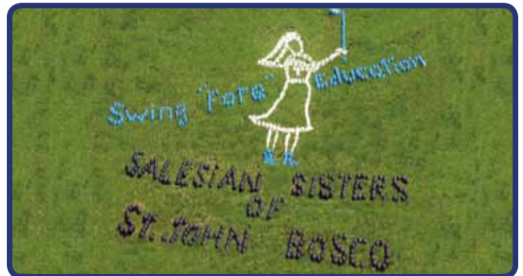
Salesian Sisters' Golf Logo in Golf Ball Art