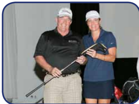
LONGEST DRIVE, LADIES