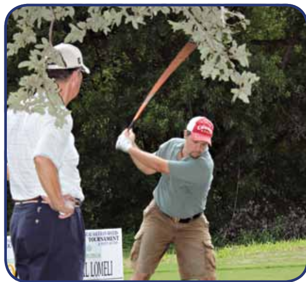
Golfer taking a swing.