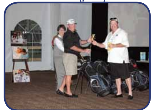
CLOSEST TO THE PIN