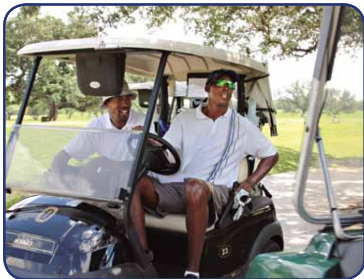
Bruce Bowen (l) and Sean Elliott (r) head out to the first tee.