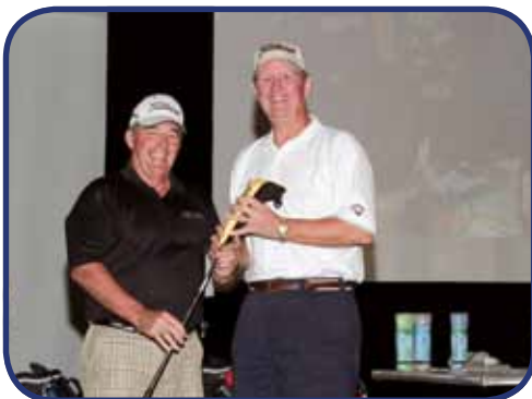
LONGEST DRIVE, MEN’S